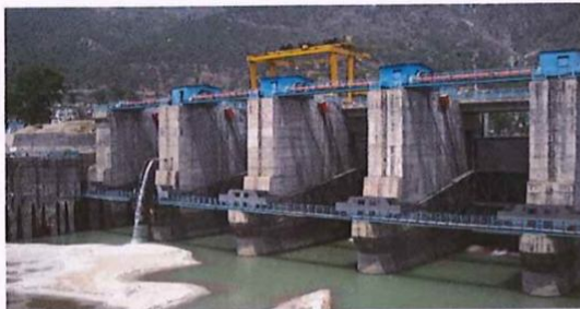
Radial Gate Barrage